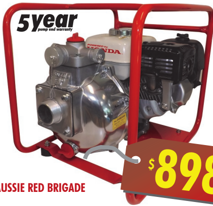
AUSSIE RED BRIGADE